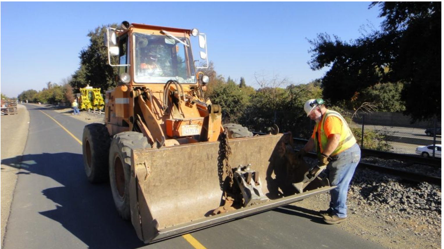
Frank grabs a jack from the bucket of the loader...