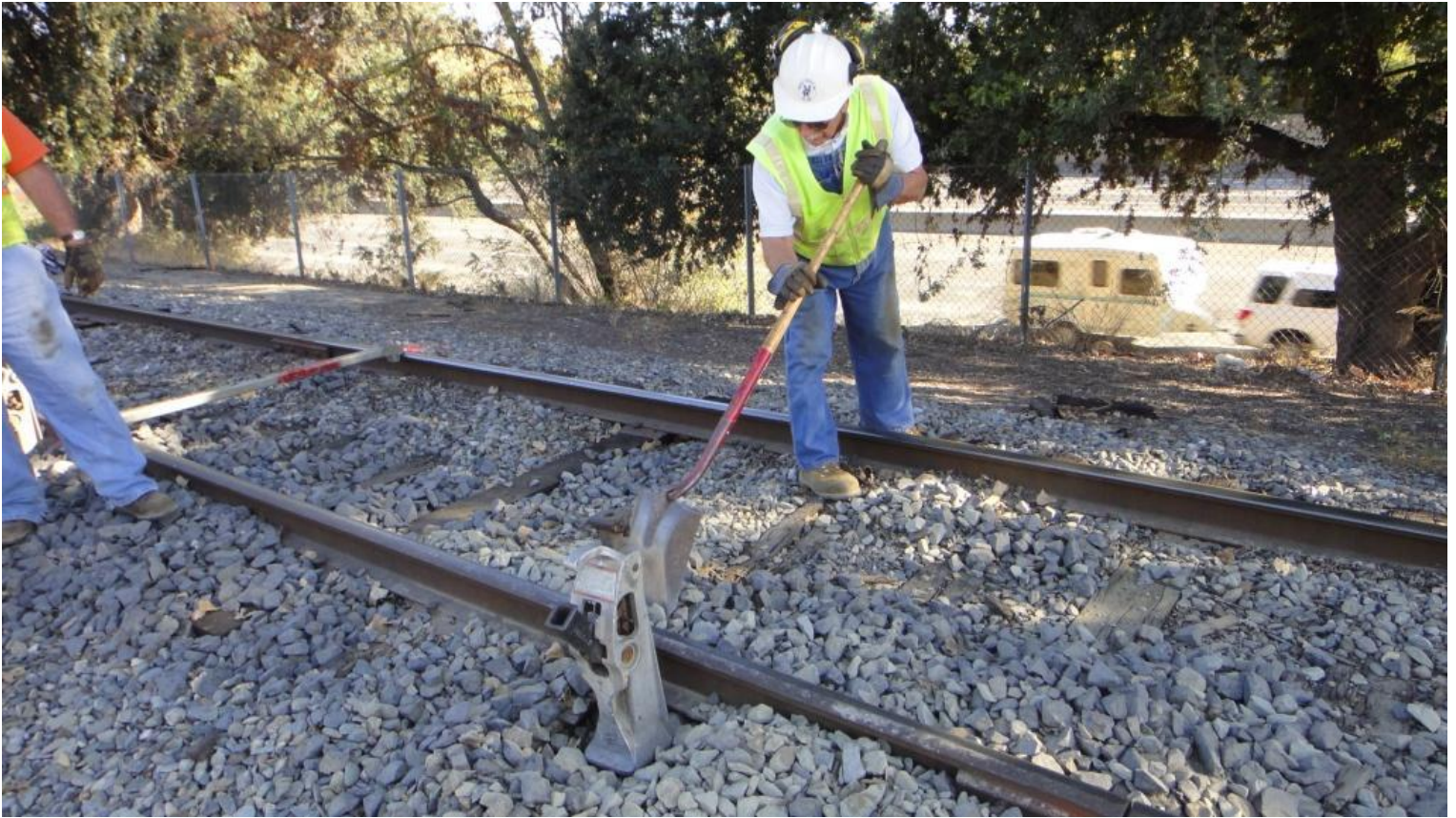
Clem scoops rock off of the ties so that Alan in the tamper can see them when tamping