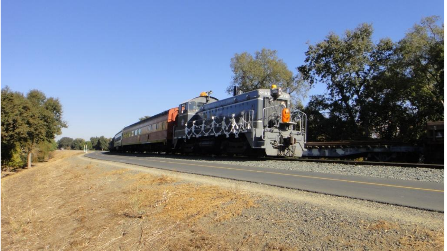
The Spook-o-motive arrives at Baths