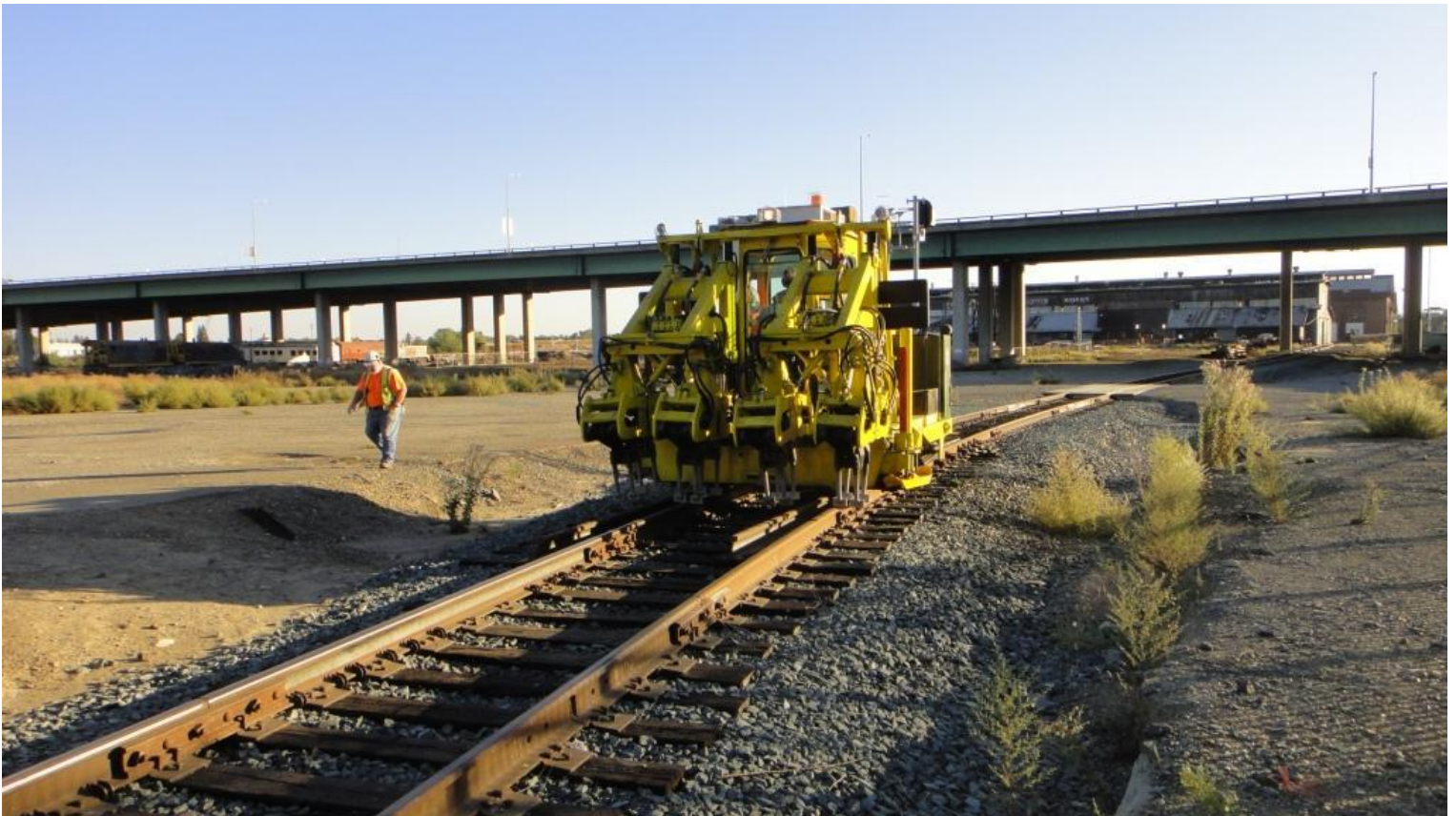
Conductor Frank secures safe passage for Alan in the tamper across the UP Mainline at RV 988