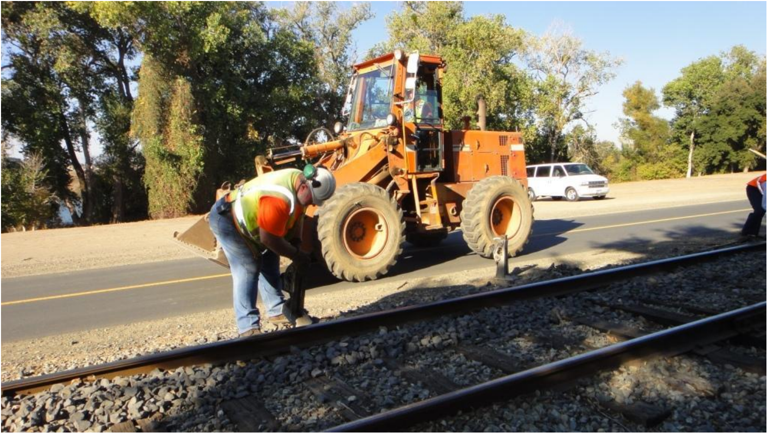
...Which he then sets as the jacking process hops-scotches down the line...