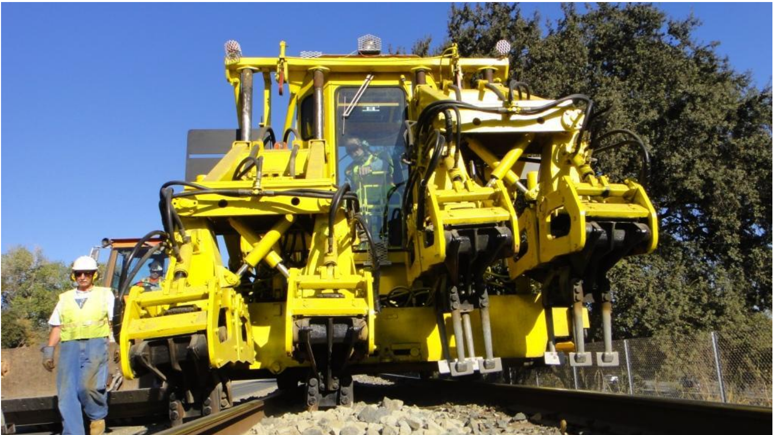
Alan in the tamper tamps-up the west rail